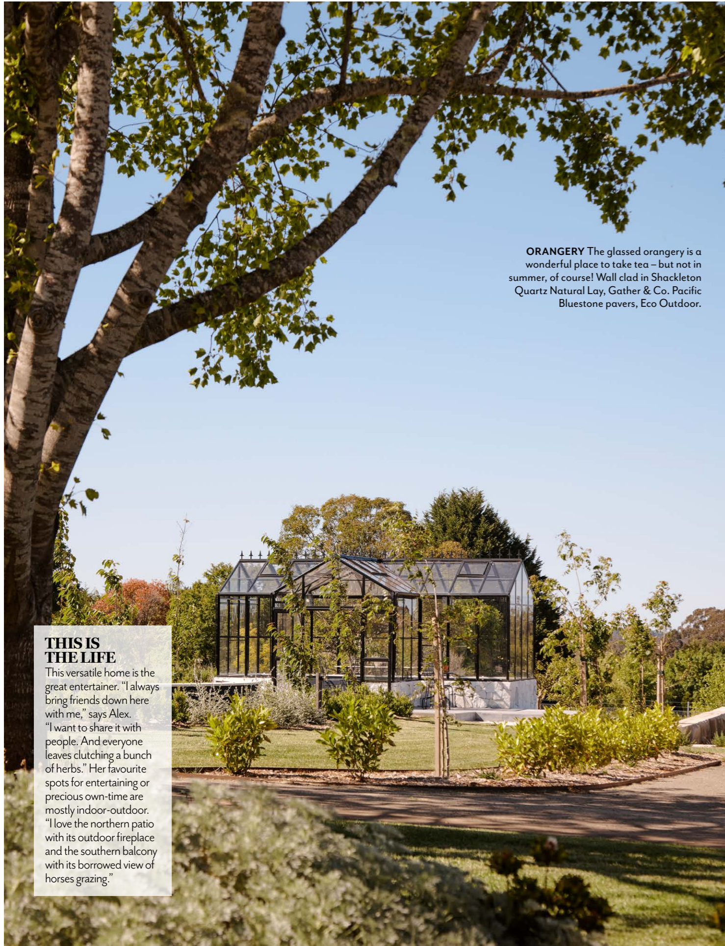
ORANGERY The glassed orangery is a wonderful place to take tea – but not in summer, of course! Wall clad in Shackleton Quartz Natural Lay, Gather & Co. Pacific Bluestone pavers, Eco Outdoor.